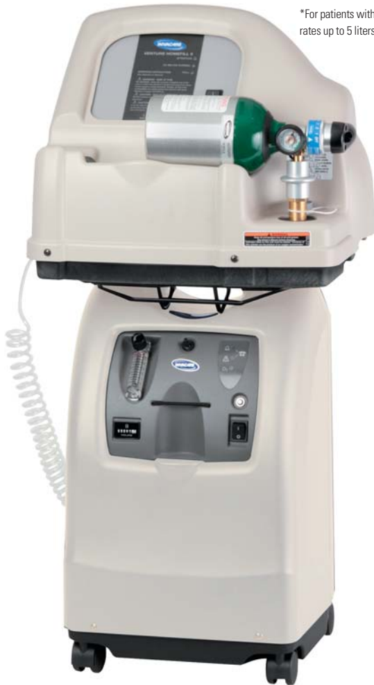
HomeFill System with optional IOH270 Ready-Rack shown

*For patients with oxygen flow rates up to 5 liters per minute.